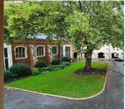
View from lounge