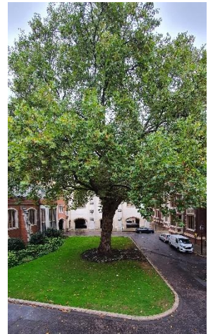
View from lounge