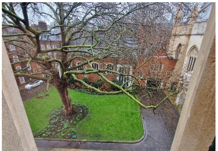
View from Bedroom