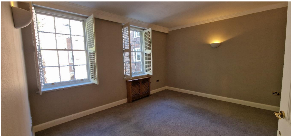
Large lounge with views of Gatehouse Court

Rent is £21,320 on an Assured Shorthold Tenancy for 4 years reviewed after 2 years