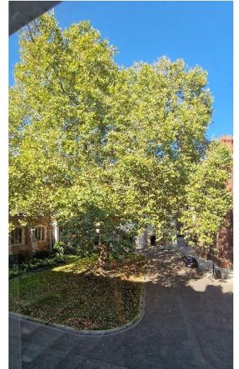
View from lounge