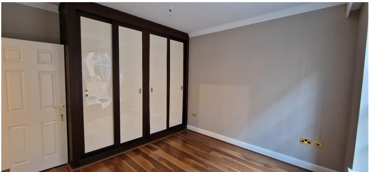
Double bedroom with fitted wardrobes