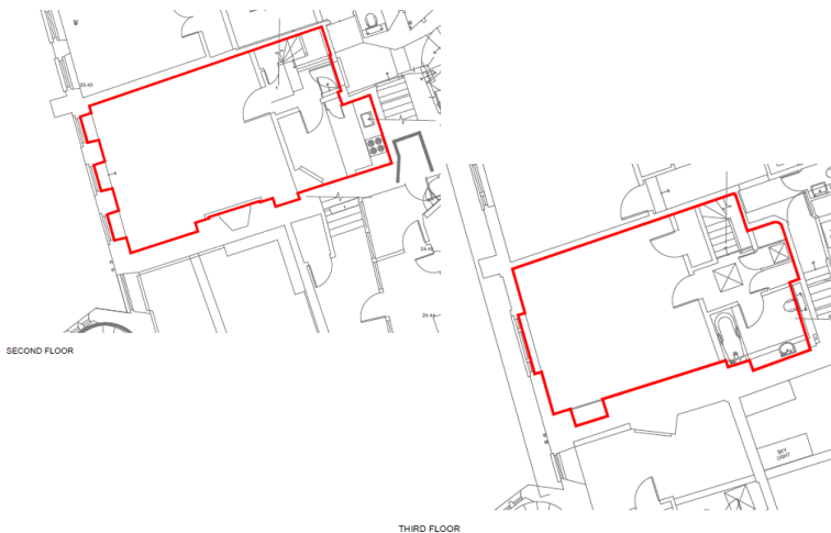
Indicative floor plans